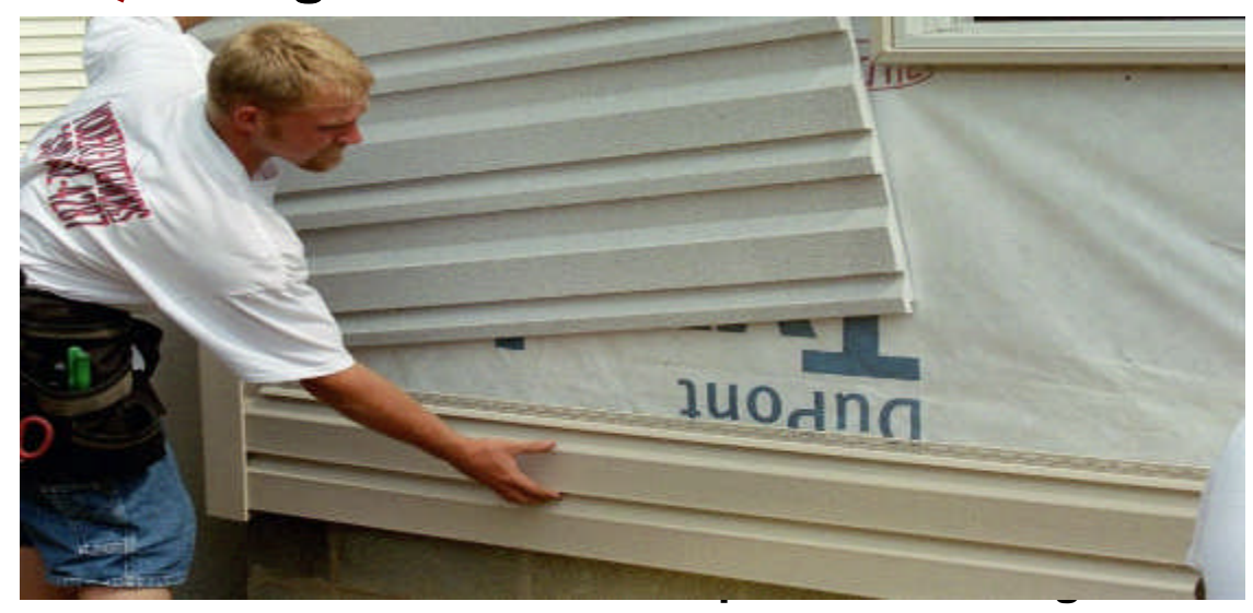
fill this void.

A. Attach the vinyl siding panel to the starter strip, then before nailing the siding, rotate the top of the panel away from the wall and drop a FULLBACK foam panel behind the siding.